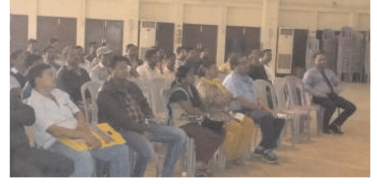
IAP conducted with Nirmal Bang Securities Private Ltd. for employees of Indian Government Mint Conducted at Salboni, West Bengal on November 25, 2016.